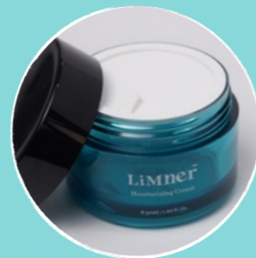
*Dust Cover Included